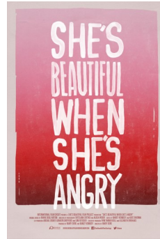
She's Beautiful When She's Angry shesbeautifulwhenshesangry.com

Using interviews and rare archival footage, this film chronicles Lewis' 60-plus years of social activism and legislative action on civil rights, voting rights, gun control, health-care reform and immigration.