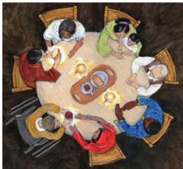
Our National City family celebrated 175 years at the Welcome Table - more details inside!

7:30 p.m. Communion and Candlelight Bring a friend!