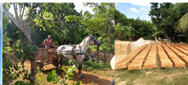
The collective farm in Artemisa province.