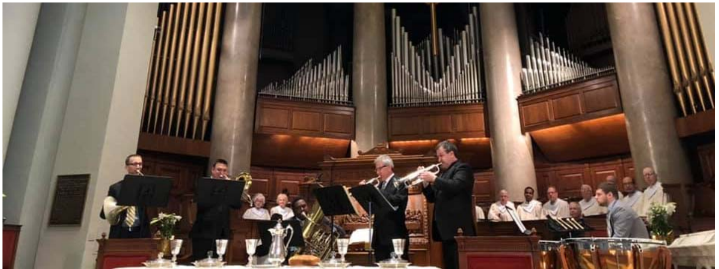
Easter Sunday with the Ephraim Brass Ensemble and the wonderful Sanctuary Choir.