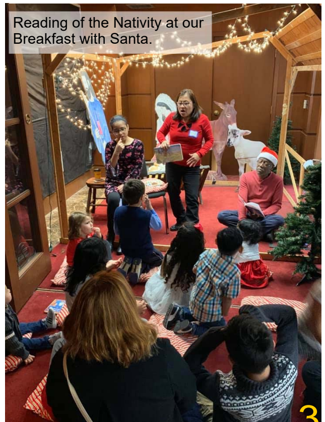
Reading of the Nativity at our Breakfast with Santa.