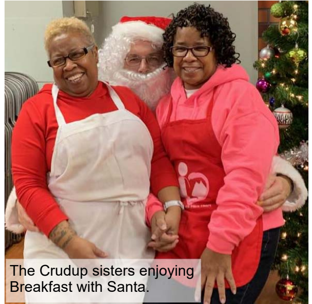
The Crudup sisters enjoying Breakfast with Santa.