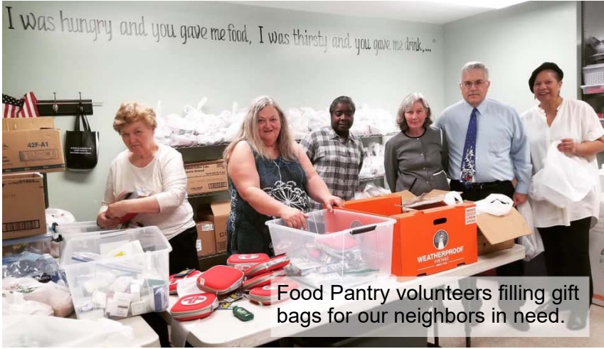
Food Pantry volunteers filling gift bags for our neighbors in need.