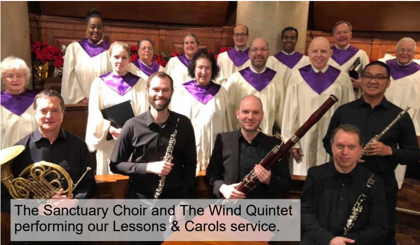
The Sanctuary Choir and The Wind Quintet performing our Lessons & Carols service.